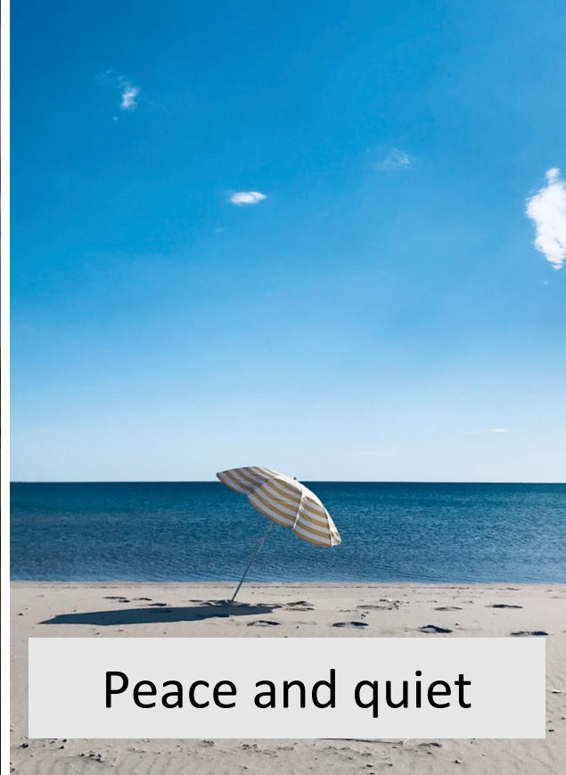
Peace and quiet